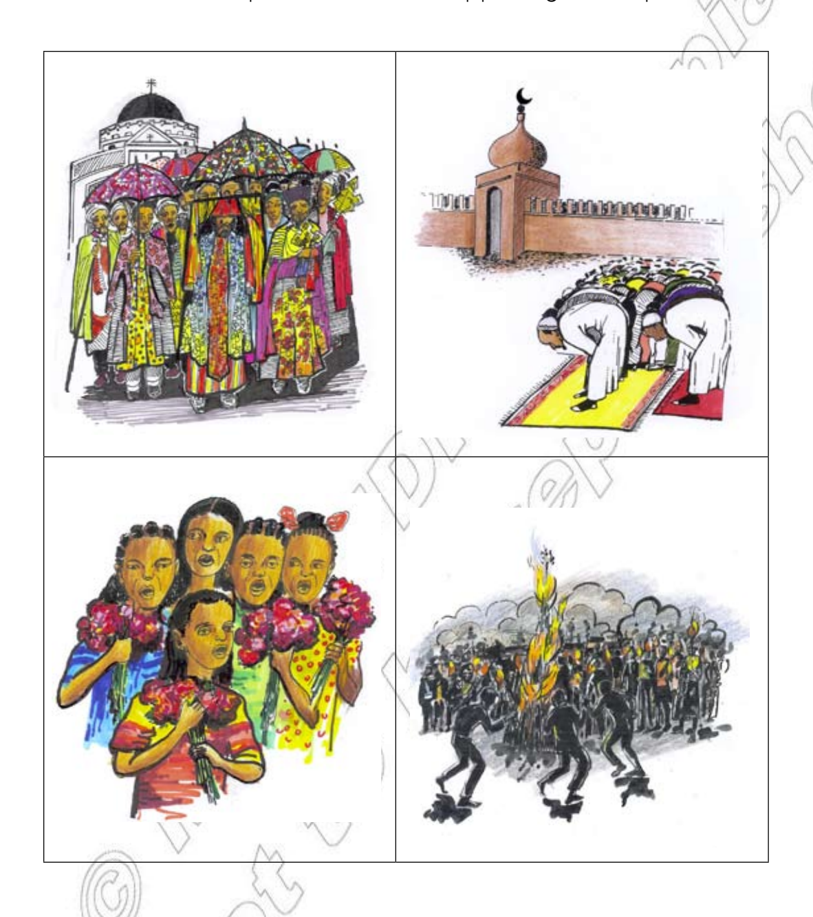
Activity I Directions: Study the pictures of Ethiopian holiday scenes below. Tell your partner what is happening in the pictures.