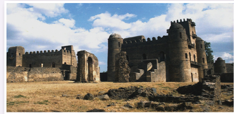
Castles of Gondar