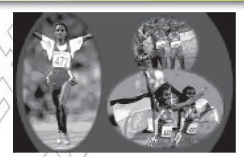
Derartu Tulu was a gold medal winner in Olympic games

Which of these people is a patriot? Why? Discuss as a class.