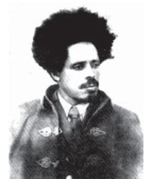
Ras Abebe Aregay, famous leader of Patriots during the second Italian invasion