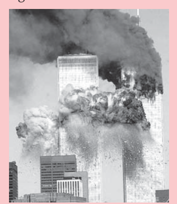
The twin towers in New York destroyed by terrorists in 2001

The twin towers of the World Trade Center, New York, were crushed by the act of terrorists on 11 September 2001. 2,974 people died and 24 remain listed as missing.