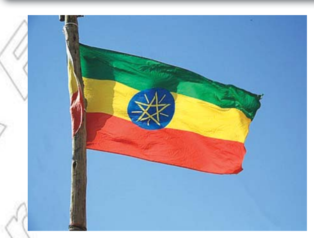
The Ethiopian Flag

Form groups to discuss the different purposes that flags serve for countries, organizations, etc.