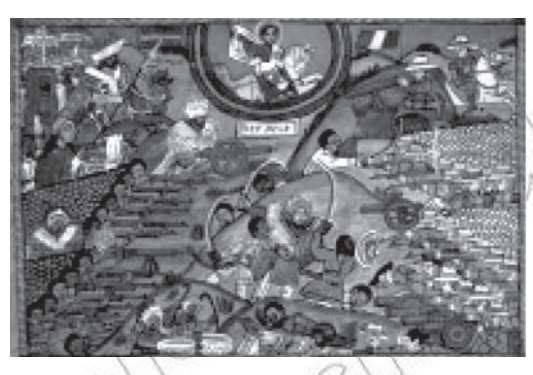
Painting of Battle of Adwa by Mekonnen

Name some patriots who fought the Italians during their second invasion (1936-1941).