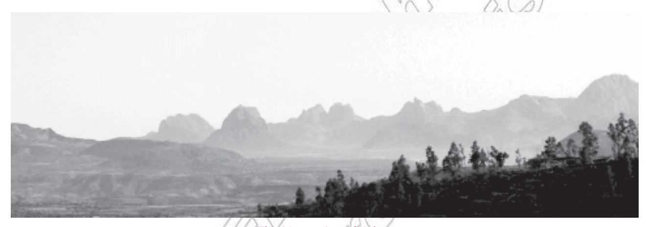
The Mountains of Adwa