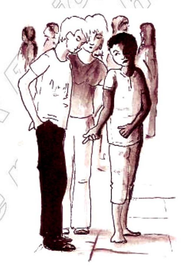
A healthy and strong young person begging

Some developed countries have a lot of income. But this income may not be shared with all the people. Some people in these countries have a very small income compared to others. Some