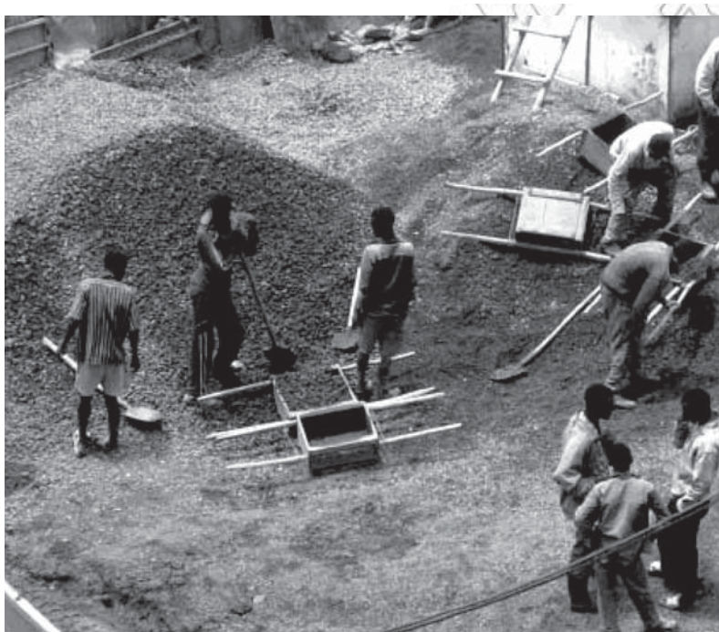
A group of blue collar workers on a building site