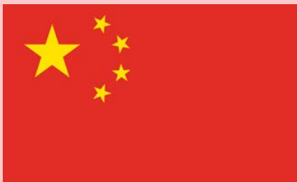
Flag of China

For a very long time the Chinese had a command economic system. The government decided what was to be produced, how it was produced and how it was distributed. The government also took what the farmers produced and decided what the price was for that product. Individuals were not allowed to be owners of big companies.