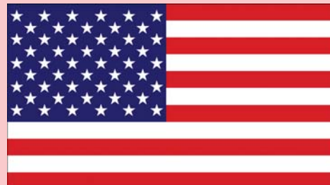
Flag of the U.S.A.

In the United States it is the individual that decides