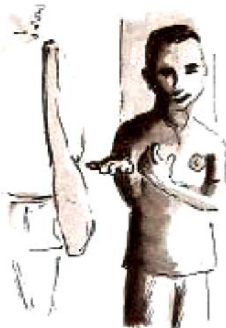
A young person begging

Self-reliance is the ability to support and take care of yourself. It is also the ability to make decisions independently. Self-reliance means to be free from the influence and control of others.