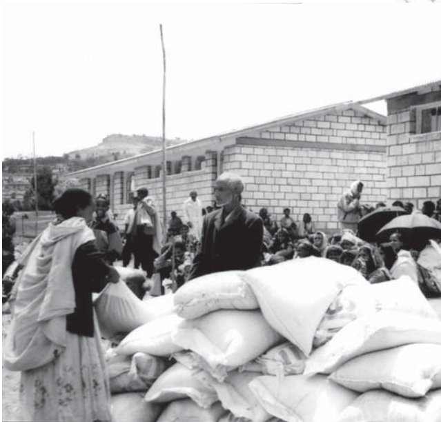
People receiving food aid

Do you think that receiving food aid from outside can increase dependency?