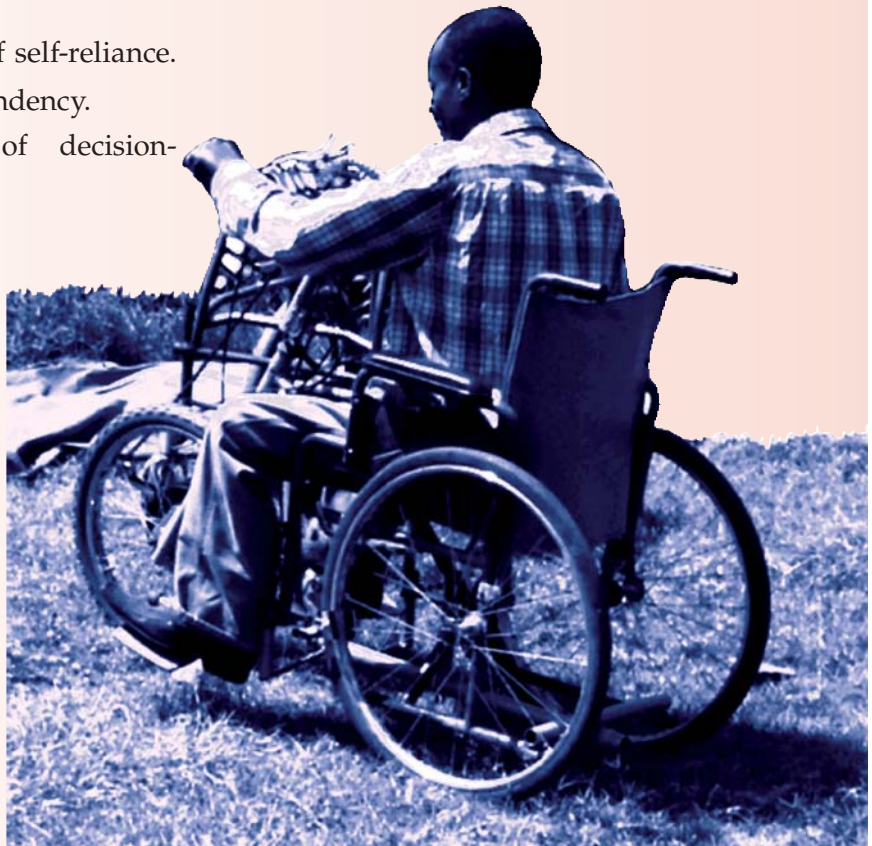
A self-reliant disabled person