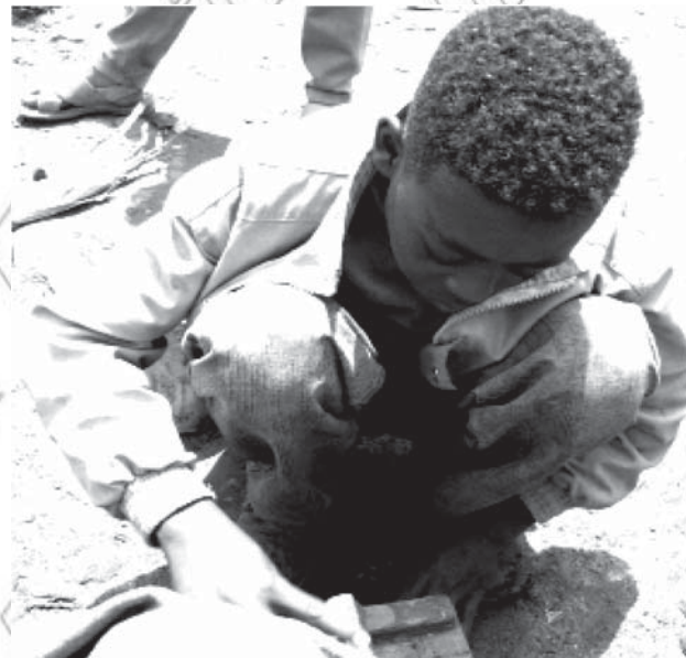
A shoeshine boy

But self-reliance does not mean complete independence . We cannot be completely self-reliant. Sometimes we need some support from