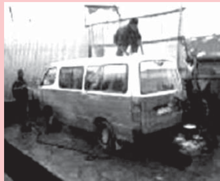
A car washing cooperative

They got some help from an organization called Business Development Service (BDS). The organization provided them with a business idea. It also helped them to organize themselves in a car wash cooperative. The city administration of Addis Ababa gave them land and helped them to get credit from a micro-finance institution. They built a small office and a mini oil shop and started a car washing business. Working together, the twelve members of the cooperative managed to create work and earn a good income.