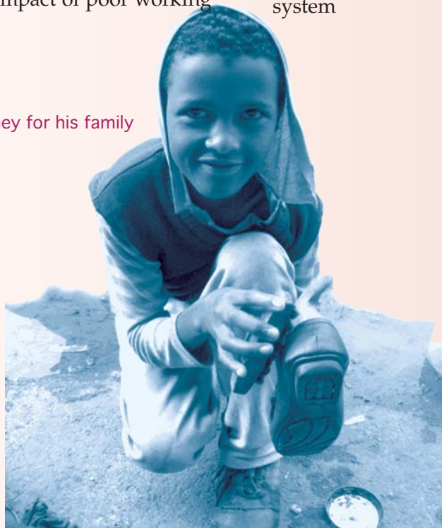
Shoeshine boy earning money for his family