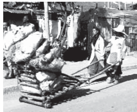
All types of work are important

All types of work are important and should be respected. Both white collar workers and blue collar workers are important because we cannot