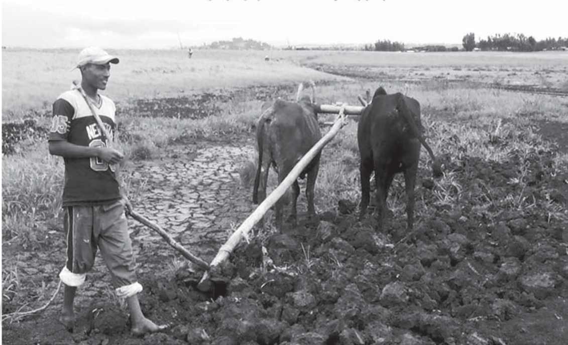
Physical labour is no less important