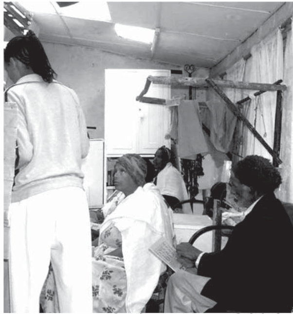
Students teaching older adults literacy skills