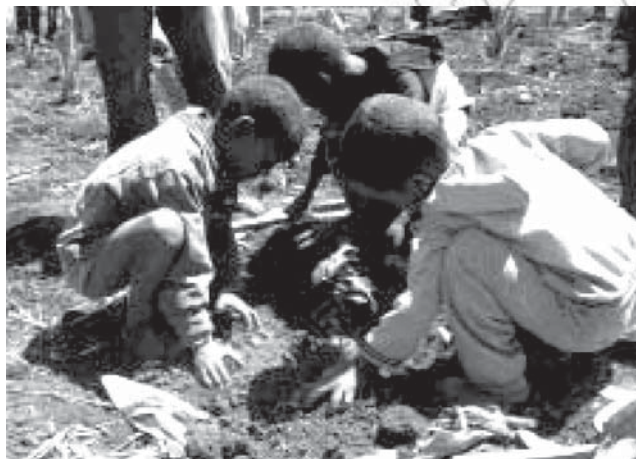
Children develop good working habits at an early age

When you lack good working habits you will not accomplish your assigned tasks well. If the work is not accomplished, people who need those goods or services will not benefit. The organization will not benefit either because it will not achieve its aims and goals. Without good working habits of its citizens, the country will stay in poverty because the economy will not grow. Therefore, lack of good working habits hurts both the individual and the country.