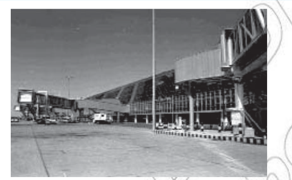
Ethiopian Airlines facilitates investment

What role do you think saving has in development?