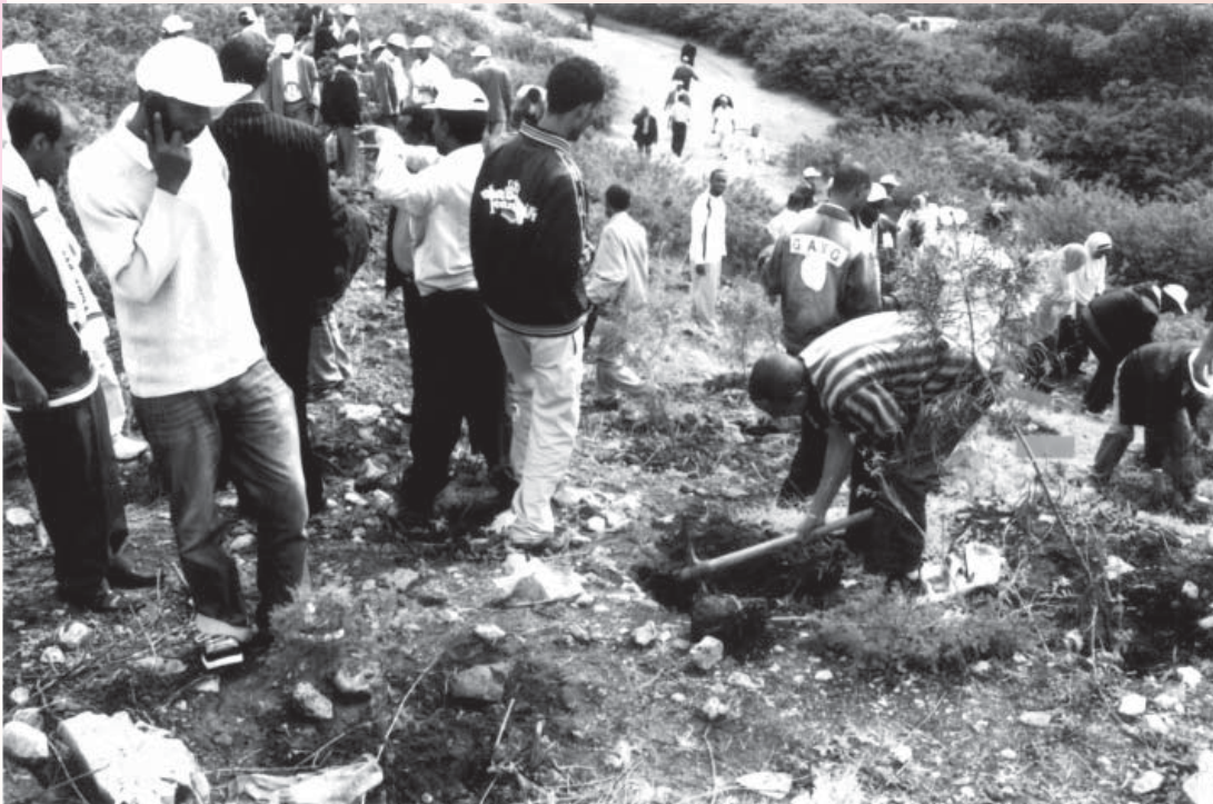
Citizens involved in community activities