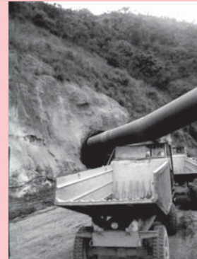
Building an Ethiopian hydroelectric power plant

? Form groups to produce a justification for resettling people from this area in the interest of national development. Group leaders should present their ideas to the class for discussion and debate.