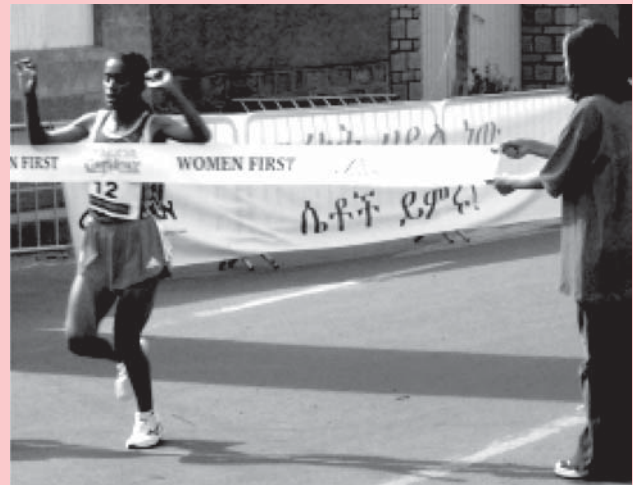
Female Ethiopian athlete

In the 2008 Beijing Olympics, Tirunesh Dibaba set a new world record in the 10,000 meters women competition. She performed this great feat in the face of very tough competition. Her achievement is a pride for the Ethiopians. She displayed a great deal of determination to translate what she promised to the Ethiopians into practice. She set a new world record in an environment that was hot and humid. She is one of the icons of Ethiopia and a role model for Ethiopian girls.