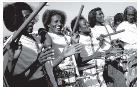
The Afar people

? Form groups to discuss the positive and negative activities that can affect the unity of the peoples of Ethiopia and list them.