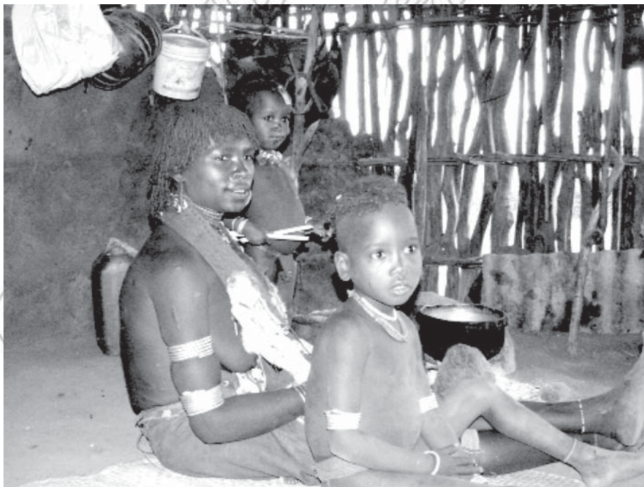
Hamer family group