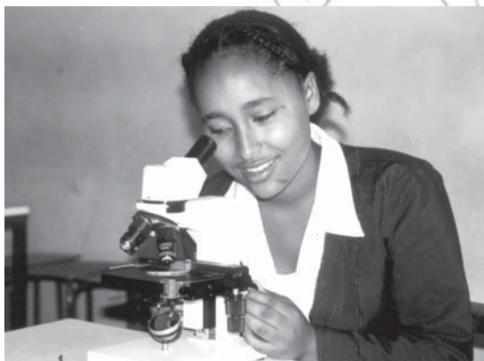
Medical student working in laboratory

You have equal rights to participate in the