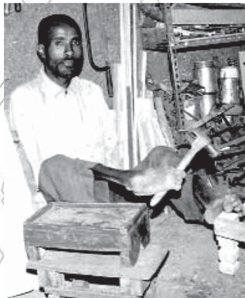
The disabled can be productive

? Form groups to discuss whether women can do more if given the opportunity and treated equally. Group leaders should present their ideas to the class for more discussion.