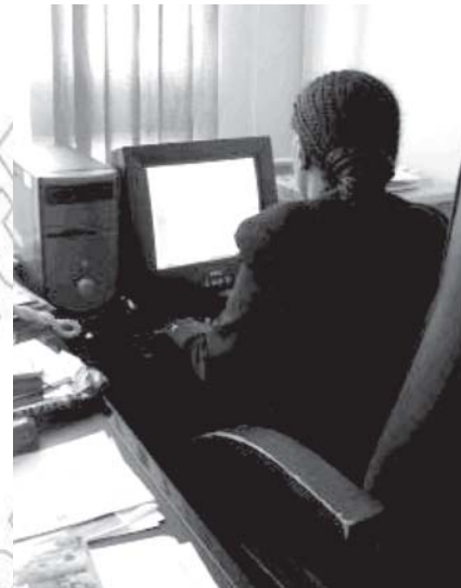
It is important to update your IT skills

? What could your role be in the technological development of Ethiopia?