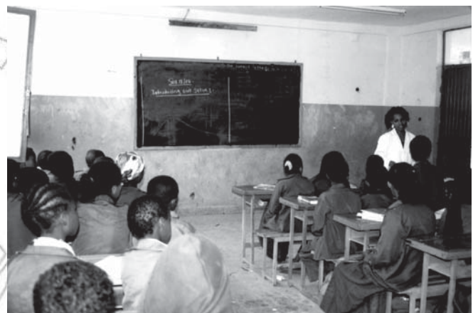
A teacher with her class

? Your teacher has many professional skills. Try to list five of them. How might your teacher improve two of these?