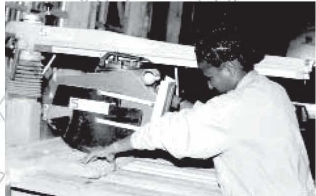
All work deserves respect

This means we have to respect every profession and realize that, without these professions, our lives will not be fulfilled. When we see a person whose job involves manual labour, we have to respect that he or she is creating something useful for us. If you, for example, collect some wood in your neighbourhood and make a table, then it means you are making something useful. So you have to respect the woodwork profession.