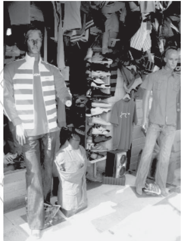
Goods imported from other nations

? List some of the other positive and negative effects of globalization.