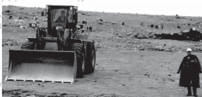
Chinese worker involved in the Ethiopian road building program

? What do you feel about the poverty level in Ethiopia? Do you think hard work could change anything?