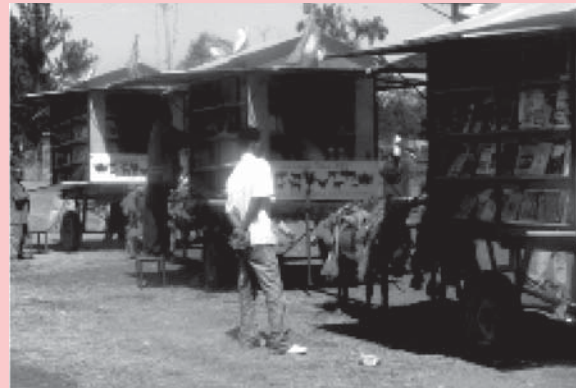
The donkey library in Hawassa bringing books to the children

Discuss ways to develop reading habits and increase knowledge and wisdom.