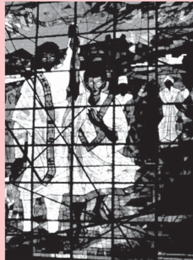
Afework's stained glass window in the AU building, Addis Ababa

He works in a variety of media: paint, pen, stained glass etc., and his approaches to his subject include symbolism and abstract. He was influenced by Ethiopian heritage and African culture among other things. He met many other famous contemporary artists as he travelled round the world and received many awards. His work is a source of pride in Ethiopia and he continues to influence many new artists.