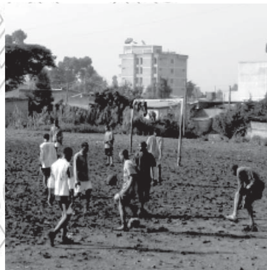
Playing football is one kind of leisure activity

Make a list of all the things you do during your leisure time. Classify those things into two columns. One column should include all the activities you do with your friends and family. The other all the activities you do by yourself. This shows your level of social interaction during your leisure time.