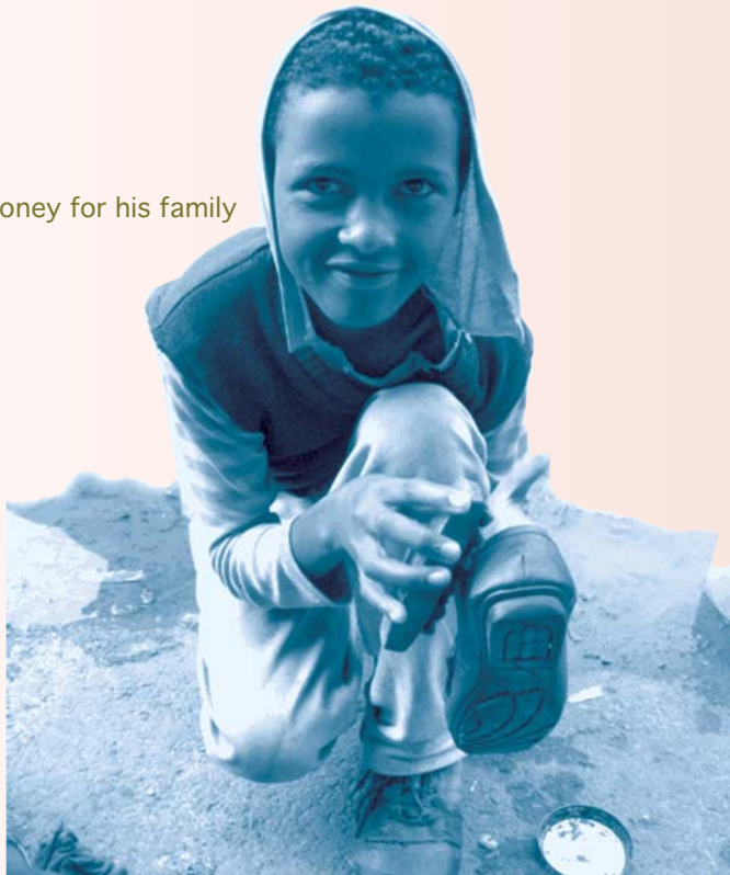
Shoeshine boy earning money for his family